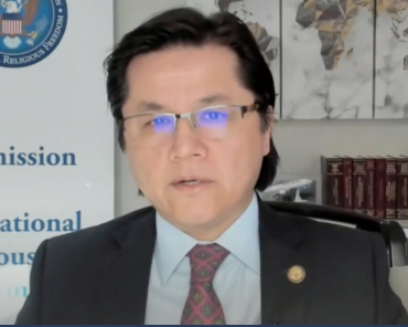
USCIRF Commissioner Nury Turkel

U.S. Commission on International Religious Freedom