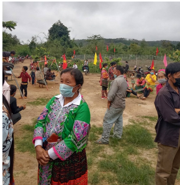
Standing in line to vote. A woman wearing traditional Hmong clothing.

On election day all residents of Subdivision 179 of voting age cast their votes. For the first time their existence as local residents of Lieng Srong Commune was recognised.