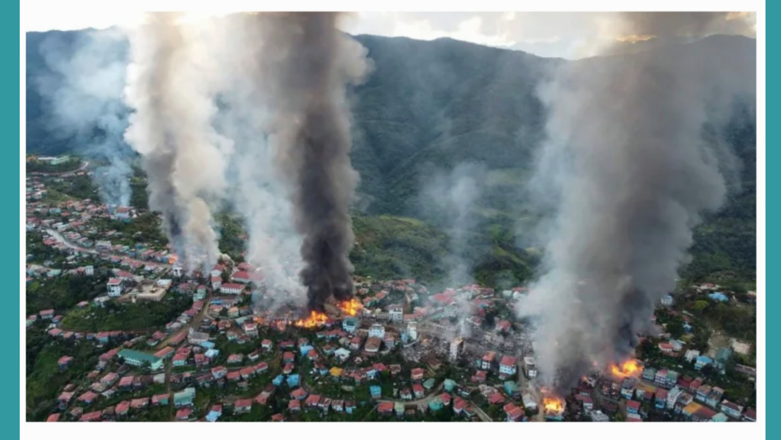
Fires burn in the town of Thantlang in Myanmar's northwestern state of Chin, on Friday. More than 160 buildings in the town, including at least two churches, have been destroyed by fire caused by shelling from government troops, local media and activists reported Saturday.

"Most of the structures on the main street, which has shop stalls and all kinds of businesses, have been destroyed. There is nothing left to salvage... The manner in which the fire was burning indicates that it was not just the incendiary rocket fires but also deliberately torching of houses and structures manually."